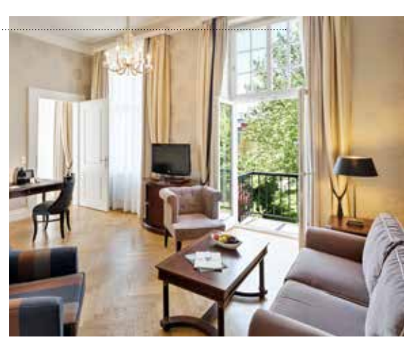
Free WiFi access in all rooms!